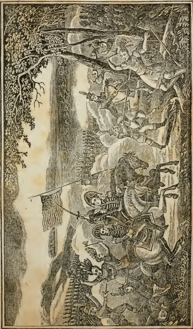
BATTLE OF THE THAMES, AND DEATH OF TECUMSEH ..... GENERAL HARRISON.